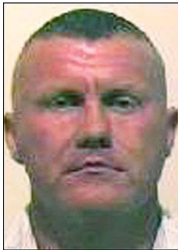
Wanted ... Raoul Moat

The photograph — taken in hospital before PC Rathband received treatment — was issued during a press conference at Northumbria Police HQ today.